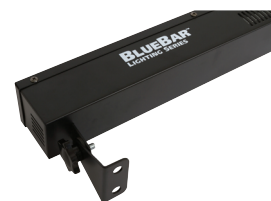
Adjustable L Brackets