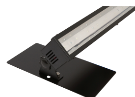
Optional Floor Stands