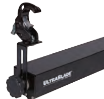
Optional Truss Clamps