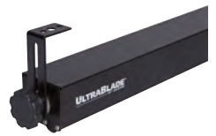
Optional L Brackets