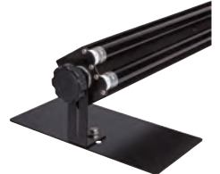
Optional Floor Stands